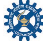
Council of Scientific and Industrial Research Govt. of India