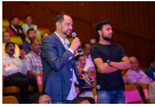
An inquisitive delegate during the Q&A session

Failure detection solutions, GA700, GA500, IIOT remote monitoring, draft gauge indicators and flow meters, magnetic flow meters, BTU meters, Thermo50 steam traps, solid fired Ecobloc CT, thermic fluid heaters, reciprocating grates, magnetic level gauges, solenoid valves, auto drain valves, pneumatic cylinders, hydraulic cylinders, telescopic cylinders, hydraulic & pneumatic rotary cylinders, FRL, hydraulic power-pack, fittings & tubings, industrial fans and air pollution control equipment (dry ESP, wet ESP, bag filter, scrubber), gasification plants, waste heat recovery systems, waste methanol production, hydrogen gas generators, safety valves, PRV, control valves, PRS & PRDS stations, etc.