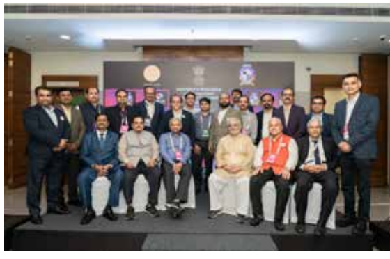
DSB team posing after the successful execution of knowledge sessions on boiler manufacturing, use & skill development