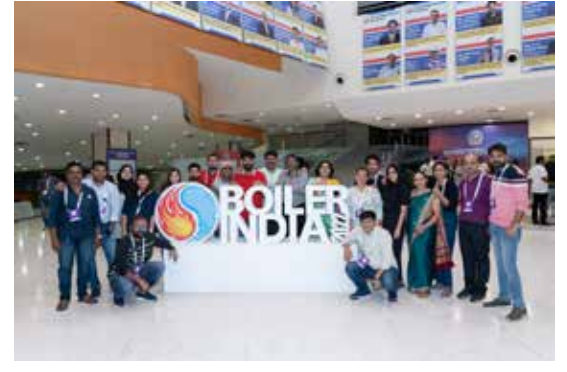
Delegates thrilled to attend technical & hands on sessions during the expo