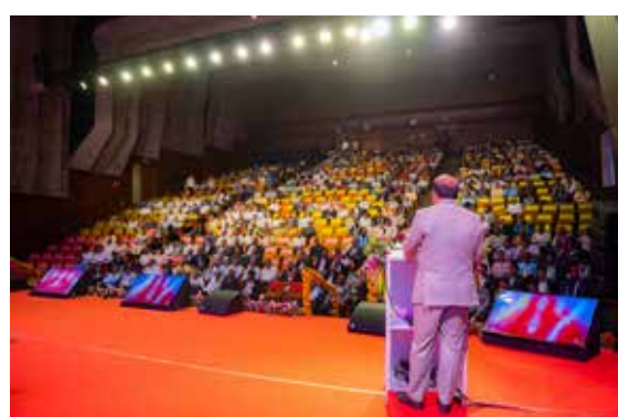
Industrial experts delivering lectures on ways to improve boiler safety and enhance plant efficiency