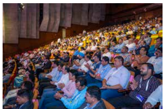
Delegates held captive by the knowledge imparted during the seminars